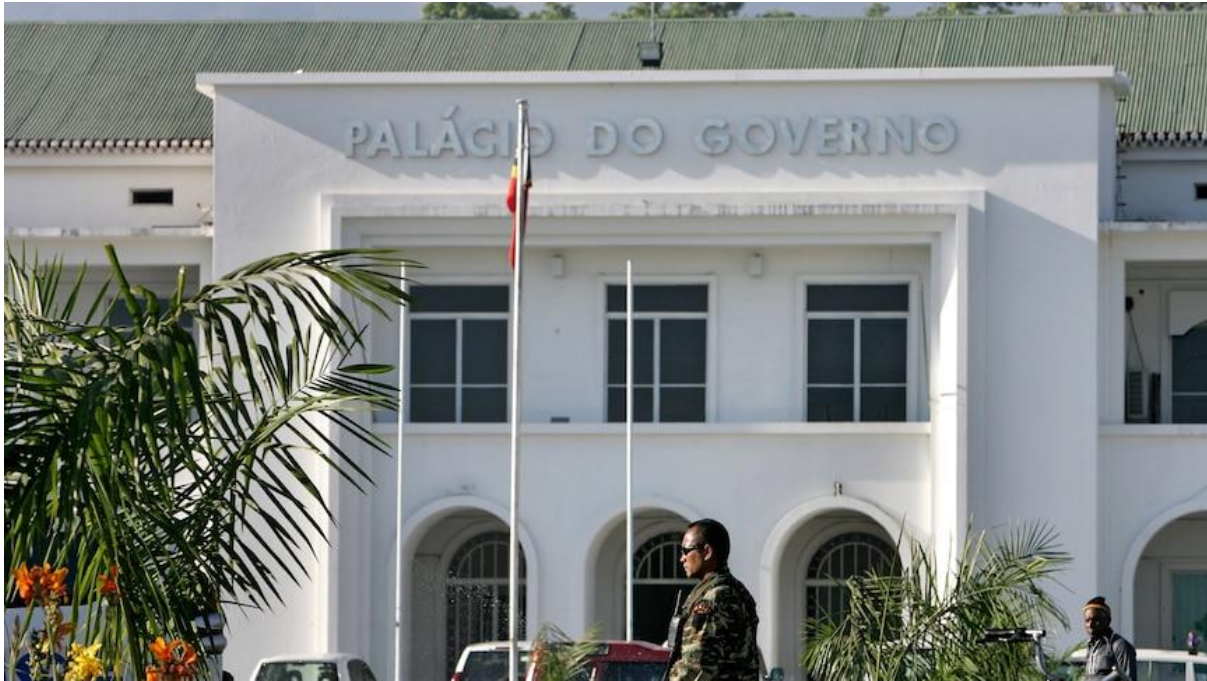
Australian spies installed listening devices in East Timor's Palace of Government in 2004, under the guise of an aid operation to renovate the offices.

Steve Cannane – ABC News -2 February 2016